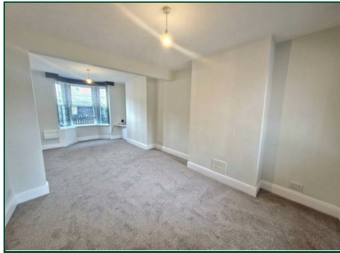
GROUND FLOOR 481 sq.ft. (44.7 sq.m.) approx.